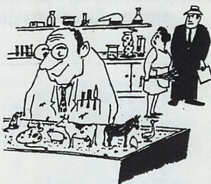
"Professor, there's someone from the A.S.P.C.A. to see you."

FOR SALE; TV satellite system: 7 1/2 foot dish, Drake receiver, Pro-Sat motor drive, mounting stand, spare feed horn/LNA, $650 or will trade for IBM compatible computer. Ralph Cook, Electronic Services, ext. 2320, or 683-7051.