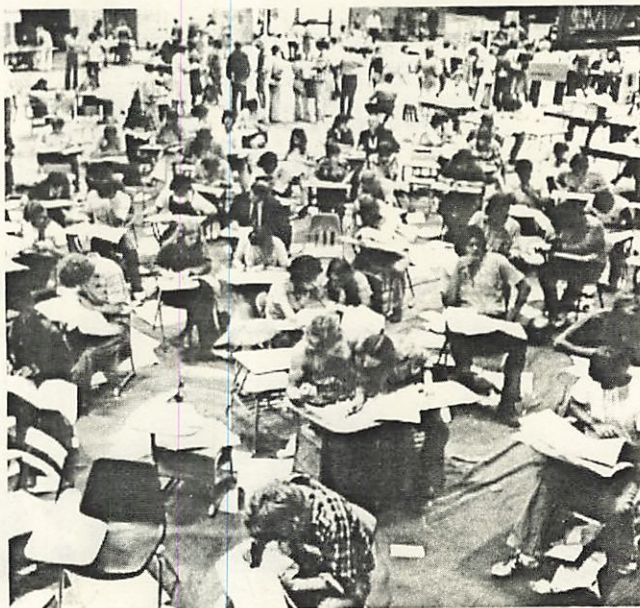
Registration in the old days.