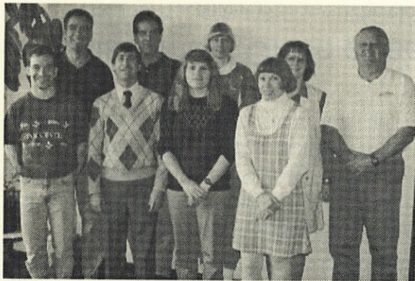
Nine days to go.

The developers proposed swapping 100 acres to the southwest of main campus plus a cash payment of $285,790, in exchange for 100 acres of Lane property to the southeast.