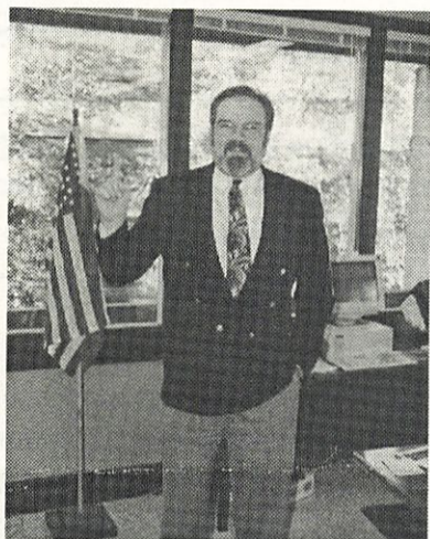
One day to go.