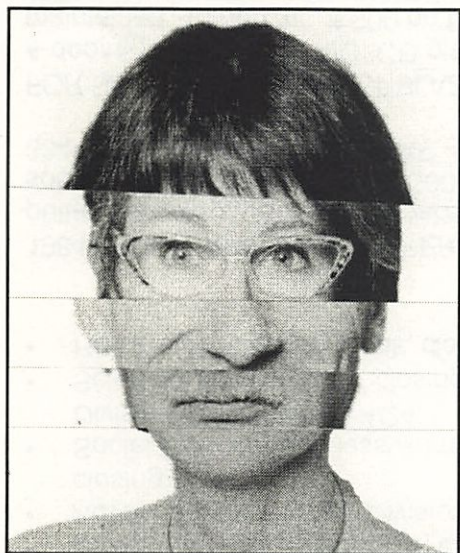
Photo collage of five Lane art instructors