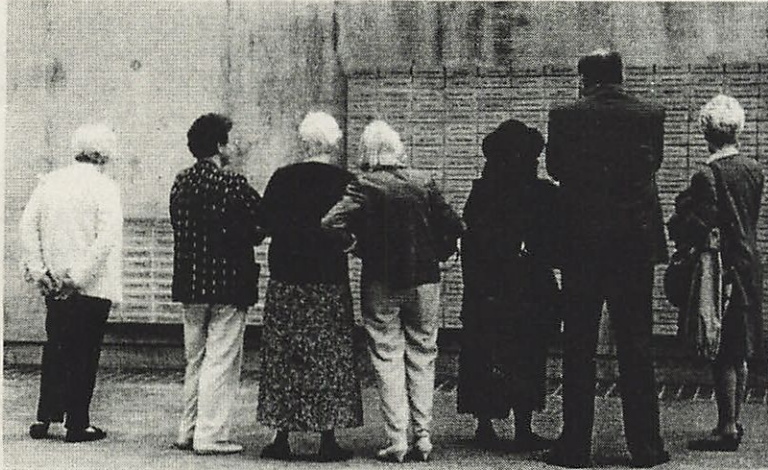
Members of the college community view the retiree wall unveiled on June 10.

Today's Daily is the last print issue. Beginning July 6 it will be distributed e-mail only to *@*@LCC. The switch to e-mail will save the college $10,000 in material costs. Beginning fall term, The Daily will publish Mondays through Fridays. Feedback may be sent to The Daily@instadv_ma or Daily@lanecc.edu.