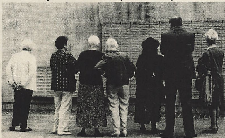
Members of the college community view the retiree wall unveiled on June 10.

Today's Daily is the last print issue. Beginning July 6 it will be distributed e-mail only to *@*@LCC. The switch to e-mail will save the college $10,000 in material costs. Beginning fall term, The Daily will publish Mondays through Fridays. Feedback may be sent to The Daily@instadv_ma or Daily@lanecc.edu.