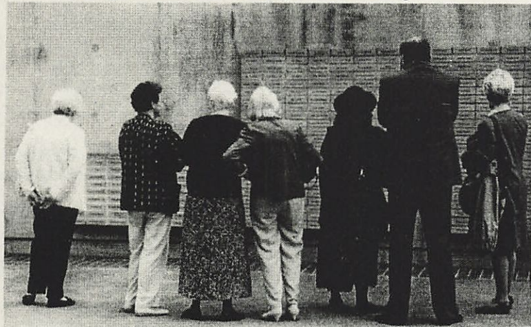
Members of the college community view the retiree wall unveiled on June 10.

Today's Daily is the last print issue. Beginning July 6 it will be distributed e-mail only to *@*@LCC. The switch to e-mail will save the college $10,000 in material costs. Beginning fall term, The Daily will publish Mondays through Fridays. Feedback may be sent to The Daily@instadv_ma or Daily@lanecc.edu.